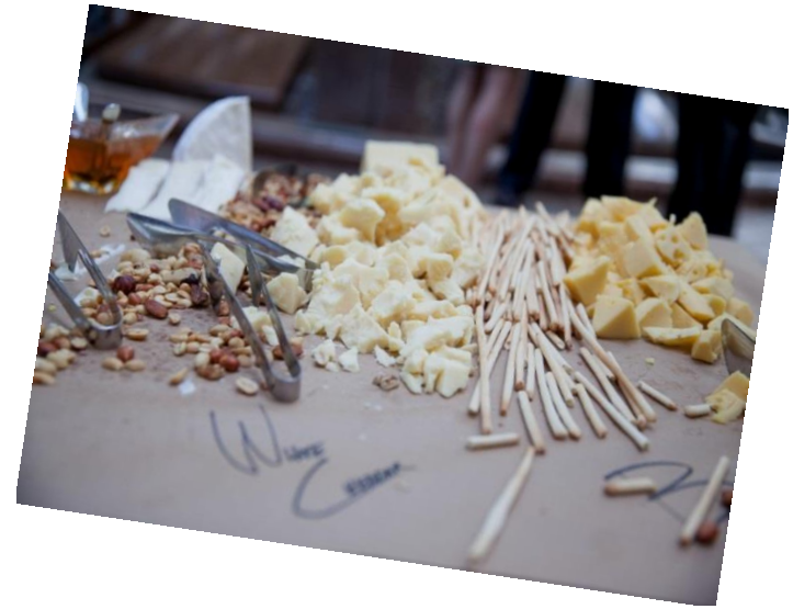
Selection of One Starch and One Vegetable

Seasonal Vegetables, Pesto Sauce, Fresh Mozzarella